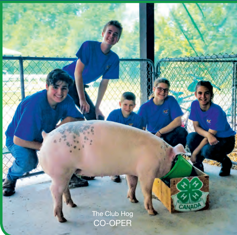
The Club Hog CO-OPER

THE SAANICH PENINSULA 4-H BEEF & SWINE CLUB would like to thank